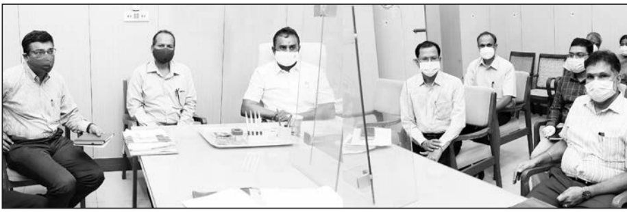
6 மாவட்டங்களில் செயல்படுத்தப்பட உள்ள கூட்டுக்குழந்தை திட்டங்கள் குறித்து உள்ளாட்சித்துறை அமைச்சர் எஸ்.பி.வேலுமணி, தலைமைச் செயலகத்தில் ஆலோசனை நடத்தினார்.

முட்டும், இன்பம் நிறைபெறும், வளங்களும் பெருக்கடும். சமூக இடைவெளியுடன் தீர்மானி நல்வாழ்த்துகளை தெரிவித்துக் கொள்கிறேன்.