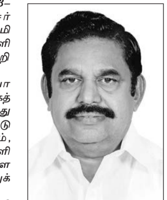
மக்கள் அனைவரின் வாழ்விலும் துன்பங்கள் நீங்கி, இன்பங்கள் பெருக்கடும் என்று வாழ்த்தி, அனைவருக்கும் மீண்டும் ஒருமுறை எனது மனமார்ந்த தீர்மானி நல்வாழ்த்துகளை உரித்தாக்கிக் கொள்கிறேன். இவ்வாறு கூறியுள்ளார்.