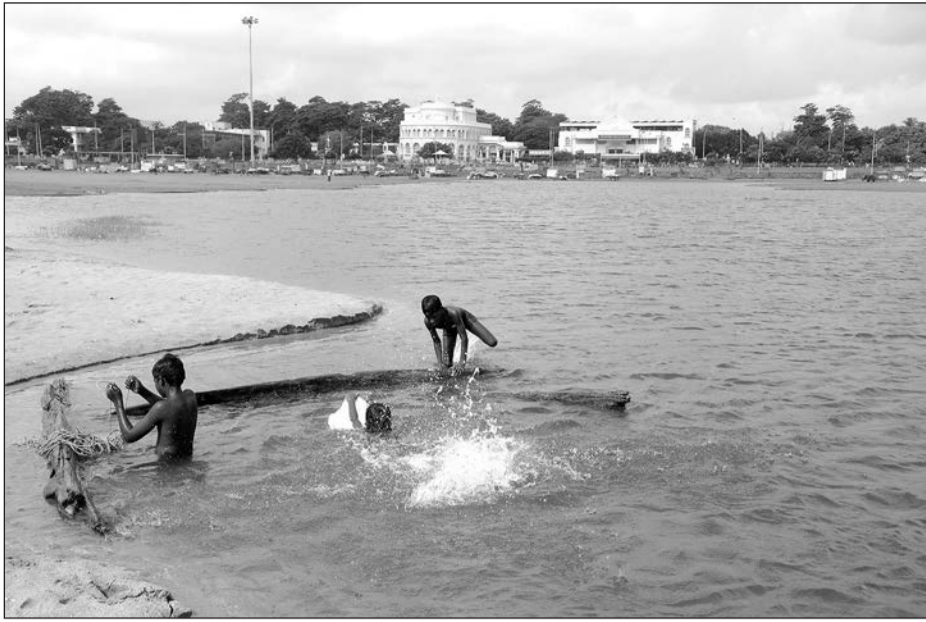
தொடர் மழை காரணமாக மொனா கடற்கரையில் தேங்கி நிற்கும் மழை நீரில் குளித்து மகிழும் சிறுவர்கள்.